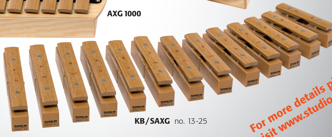
KB/SAXG no. 13-25

Xylophones – Series 1000. Now available with sound bars made of a newly designed fiberglass material with sound characteristics very close to xylophones (not too long ringing) and the advantage of constant pitch over its lifetime and in changing climates. Includes a new bass instrument with rich sound and strong volume, as well as resonator bars ranging c^1 to c^3 .