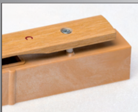
Solid mounted bars