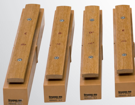
KB/SAXG no. 1-12